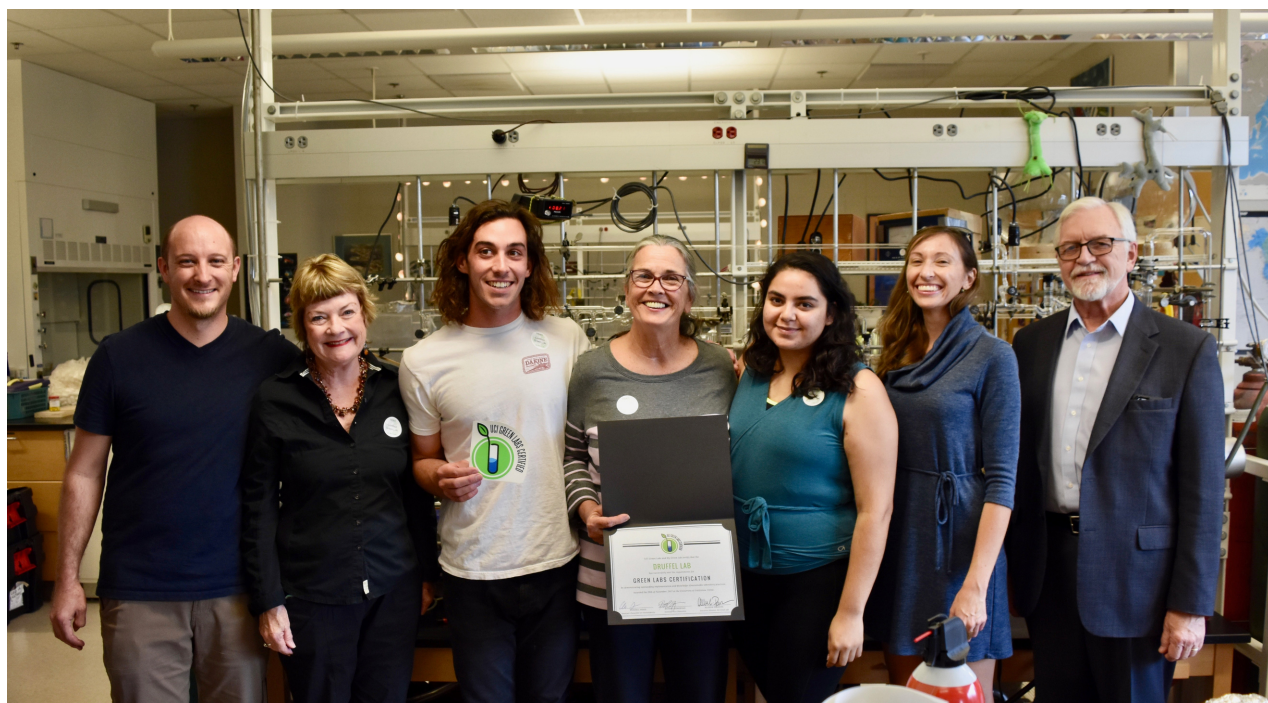
Druffel Research Group